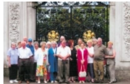
Wisbech at Kew Gardens