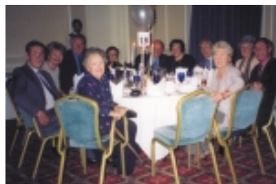
Kier Western Spring Ball