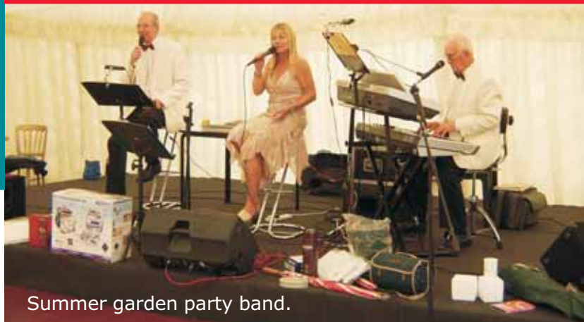
Summer garden party band.

We still have "collector's item" KGFT ties in stock. Available from Brendan O'Boyle or Hilary Edmunds at Kier Southern (above address), tel: 01923 721277. A bargain at only £5 each!