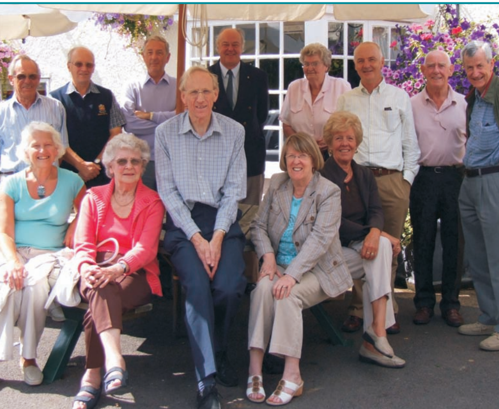
Local members lunching at The Crown, Northill.

KING TUT EXHIBITION: On 21 February, 26 members travelled by coach to the O2 arena to take in the King Tut exhibition. We had sufficient time prior to our visit to take in the former Millennium Dome and have a coffee in one of the many outlets. When we entered the exhibition we were given a short introduction before being