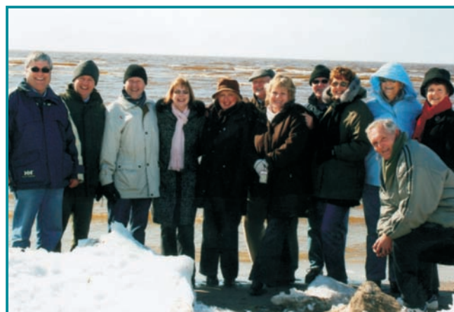
At the seaside with snow in Latvia.

During July we took a full coach of children and grandchildren to Skegness where a good time was had by all. Later in the month we went to the Dad's Army exhibition in Thetford followed by the gardens and miniature train rides at Bressingham.