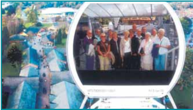
Trentham Gardens, Stoke-on-Trent.

Sunday 19 July saw 37 members make the journey to Suffolk to visit HMS Ganges, Constable Country, Flatford Mill and Jimmy's Farm with his little piggies. An enjoyable day was made all the more interesting by having a knowledgeable Blue Badge guide on board.