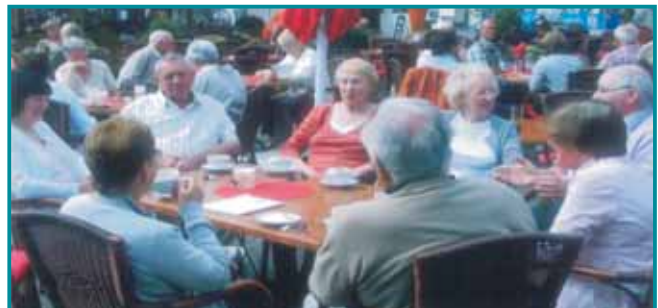
Trip to Germany.

An excellent holiday was had by all and our thanks go to our organiser.