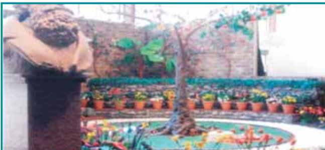
Shrewsbury Flower Show.

August arrived and we made our usual trip to Shrewsbury for the delights of the Flower Show.