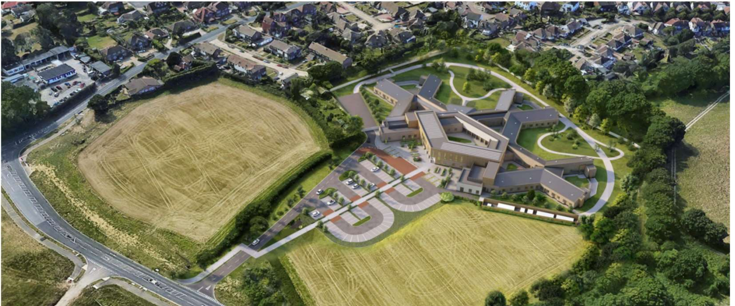
Development Overview