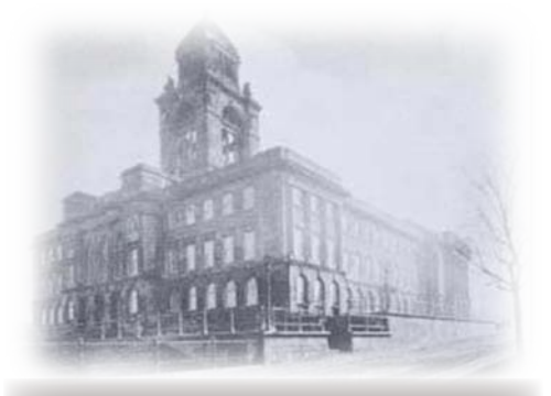
Wallasey Town Hall

"Kier Construction wouldn't be the organisation it is today without the hard work and dedication of all its past employees. So on behalf of all of the current Kier employees, thank you, for laying such a strong foundation to which we can build on and hopefully continue for another 100 years."