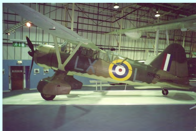
WESTLAND LYSANDER R9125

Today not much remains of Tempsford airfield and it is quite possible to drive along Everton Road without realising that it was once a major airfield. The barn where the agents assembled for their flights has been refurbished and stands today as a memorial to the brave men and women who were based on the airfield during the war and to those who gave their lives for their countries. The barn can be visited by appointment, as can the Parish Church in Tempsford Village where memorabilia of the two squadrons can be viewed.