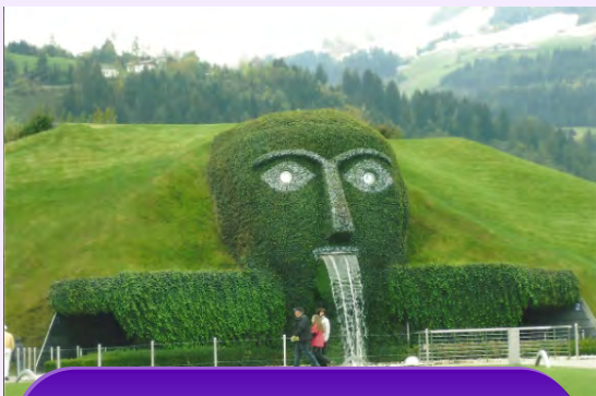
Outside the Swarovski experience