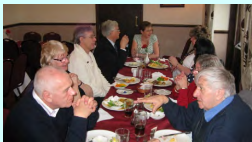
13 Members attended the Red Lion during September for a Luncheon.