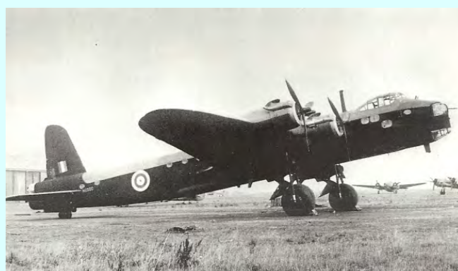
N6090 SHORT STIRLING RAF A66E

These aircraft were used by RAF Tempsford to deliver and recover S.O.E members, to enemy occupied Europe, time on ground would only be a few minutes.