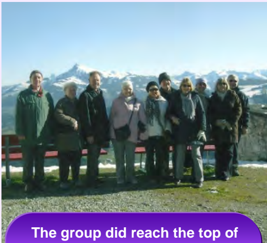
The group did reach the top of the Mountain

We finished the year with a New Year four day break at the Redworth Hall Hotel in County Durham in first class surroundings with plenty of food and drink.