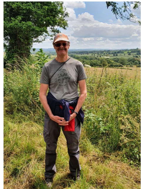
In the Cotswolds 2021