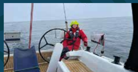
On the way to Arklow: the crew keeping dry down below

We had some great local fish & chips for dinner that evening and ate them sitting at the cockpit table – very pleasant. There are two pubs in Kilmore Quay and we tried them both that evening ending up the Wooden House pub where Clwyd arrived around 21.30hrs.