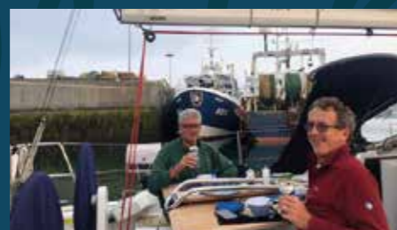
Dinner onboard at Kilmore Quay, Republic of Ireland

were motoring out, a ferry heading out to sea passed us escorted by a tug. Quite unnerving in the dark. We had favourable winds and sailed along at over 6knts in heavy rain. At around 13.00hrs the rain stopped, the wind died and a mist surrounded us. With a strong tide against us we motored the rest of the way to Kilmore Quay arriving in the sun at 17.30hrs having travelled 76nm. We nearly missed the entrance into the harbour as two trawlers were moored up leaving just enough space for us to enter. Before departing Milford Haven, I had dutifully filled out the Borders Forces C1331 form, a requirement when sailing from non-EU to EU member countries. As we arrived, we hoisted the yellow quarantine flag and as a courtesy the Irish tricolour. We never did see any customs officers.