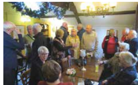
Lunch at the Old Barn Inn, end 2023