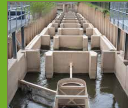
Worcester Fish Race

The River Severn Fish Pass was part of a £20m investment, with Kier as main contractor, to re-establish fish migratory routes