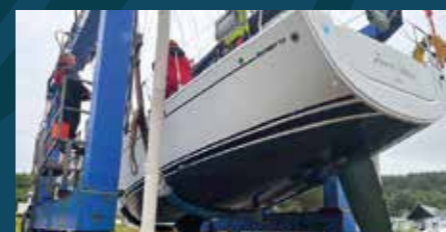
Boat lift out of Dunstaffnage

Monday 26 June: To get a few hours advantage of the flood tide, we got up at 05.00hrs and left around 05.45hrs heading to Craobh up the Sound of Jura. On route we passed the Gulf of Corryvreckan which lies between the Isles of Jura & Scarba and is the site of the infamous whirlpool. The winds were still strong and ranged between 12 to 18knts which meant that when the tide turned, we still made good time arriving at 14.15hrs having sailed 47nm. Craobh is a very pretty marina and has a clubhouse with wonderful views overlooking the marina which is where we ate that night.