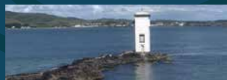
Lighthouse with Port Ellen across the bay

Port Ellen is a very pretty small village with one restaurant and one hotel serving food, both of which were fully booked – pubs tend not to do food there. Fortunately, there's a Coop so we bought food and ate on board. For weather forecasting I use an app called Predict Wind. This gives me predicted wind speeds for up to five days. Gusts of 30knts were predicted tomorrow in the Jura Sound where we were going so we decided to stay another day in Port.