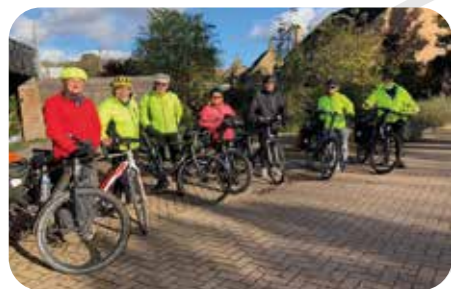
The Old Gits cycle group at the Waresley Garden Centre after a mid-ride stop (five with e-bikes!)

or longer, in the summer. There are no 'rules or regulations for the OGs, but everyone joining the rides are expected to have a well-maintained cycle, be confident cycling on all types of roads and understand that they ride 'at their own risk' i.e. there is no group insurance! However, members are encouraged to have third-party insurance – just in case of accidents involving others. Thankfully, the OGs have only had a couple of accidents. These were generally due to road conditions and not too serious. The group sets off from a local café in the St. Neots riverside park at 10.0am sharp and usually stop at a café or pub for a mid-ride stop for about 45 minutes before continuing with the return leg of the ride back to the starting point by around 3pm.