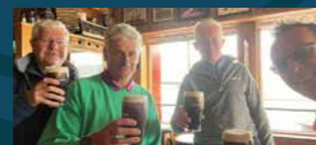
The Ferryman, Dublin

Saturday 17 June: Up at 05.45hrs and motored out at 06.30hrs. Initially the wind was fickle, and we sailed until around 11.00hrs when the wind increased to 12knts. We cut the engine and carried on under sails only achieving 6.3knts. We arrived at Dun Laoghaire marina around 12.50hrs having covered 36nm. From this marina we could catch a train into Dublin. Peter and I cleaned a small amount of water from the bilges, and looked everywhere for where it was coming from, even taking the panel in front of the waste tank off, but it was dry underneath. Much later, when we were coming down the east coast, we found the water was coming from the raw water-cooling pump. The engine heat was drying the water in the engine compartment, and it was not until it got much worse that I found the dried salts. This was to cause a problem on the last passage – more of that later.