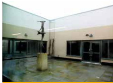
Roof Courtyard available patients

There was an open-to-the-sky, high level courtyard and some very fine original artwork also nearing finalisation. Ceiling heating panels and some ceiling TV's all led to an uncluttered, spacious and restful feel.