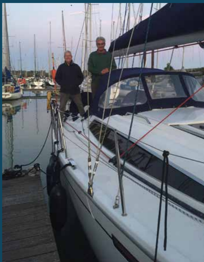
The start: 24 May 2023 SYH