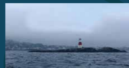
Entrance to Dublin Bay

boat called Three Swans which was on one of the pontoons in the river. The area around the marina was very industrial. We walked over the bridge and into the old town in heavy rain where we found Christies, a bar restaurant, serving local sea food and a perfect Guinness.