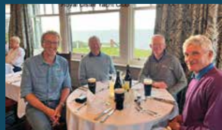
Royal Ulster Yacht Club

Wednesday 21 June: Up at 06.00hrs to leave at 06.30hrs to get out of the marina before the tide dropped too far. We mostly sailed but had to do a bit of motor sailing as tide against us was 2.7knts at times. We arrived at Bangor Marina around 15.30hrs and got tied up just as there was a torrential rainstorm with strong winds. I was glad we were safely in the harbour. All the yacht clubs welcome sailors from other yacht clubs, so we took advantage of this and went to the Royal Ulster Yacht Club for dinner. This had excellent views across the water.