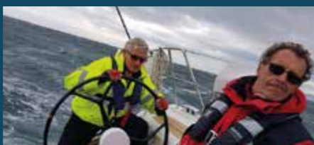
A gust of wind on the way to Ballycastle

from the Brittany coast via the Scilly Isles. We walked the short distance into Arklow village and had a very nice Chinese meal followed by a few Guinness in the pub nicknamed 'Mannies' after the old harbour master.