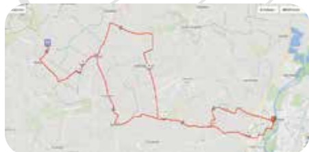
Route to the Giddy Goat Café in Riseley, 26.5 miles, 28/02/24: a typical Old Gits ride plot using the RWGPS GPS plotting software

or longer, in the summer. There are no 'rules or regulations for the OGs, but everyone joining the rides are expected to have a well-maintained cycle, be confident cycling on all types of roads and understand that they ride 'at their own risk' i.e. there is no group insurance! However, members are encouraged to have third-party insurance – just in case of accidents involving others. Thankfully, the OGs have only had a couple of accidents. These were generally due to road conditions and not too serious. The group sets off from a local café in the St. Neots riverside park at 10.0am sharp and usually stop at a café or pub for a mid-ride stop for about 45 minutes before continuing with the return leg of the ride back to the starting point by around 3pm.