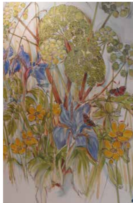
Artwork panel nearing completion

There was an open-to-the-sky, high level courtyard and some very fine original artwork also nearing finalisation. Ceiling heating panels and some ceiling TV's all led to an uncluttered, spacious and restful feel.