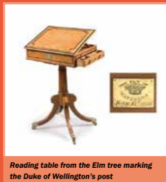
Reading table from the Elm tree marking the Duke of Wellington's post

This turned out to be a Faberge item that went on to realise a five-figure sum at auction!