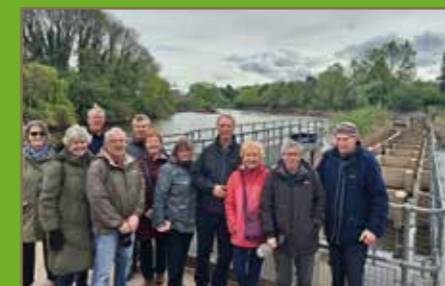
Central members at Worcester Fish Race

The venue looked after us so well that we have already booked for Christmas 2024 on 11 December – get it in your diary!