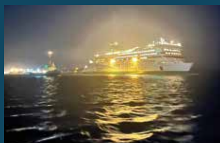
Ferry following us out of Milford Haven