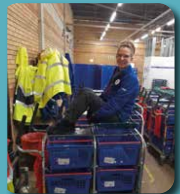
Sssssh.... Obviously no managers in the warehouse at the time this photo was taken (25/05/2024)!