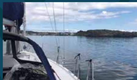
Islay and Port Ellen ahead

fast passage doing over 9knts with the tide in 200m depth of water. Once we got passed Rathlin Island the tide turned and the wind speed was 16knts but we still made 5 to 6knts. The sun was out and it made for a very pleasant sail across the Irish Sea to Scotland. We arrived at Port Ellen on Islay at 13.10hrs, having sailed 29nm. The entrance channel to the port has lots of exposed rocks but is well marked as the local CalMac ferries use the port. The small marina is owned by the community and profits are invested locally. We investigated access to the local distilleries and found that Laphroiaig was within walking distance so we headed off for a tasting. They were all a bit peaty for me but Martyn bought a bottle.