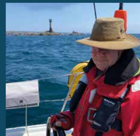
Rounding Land's End