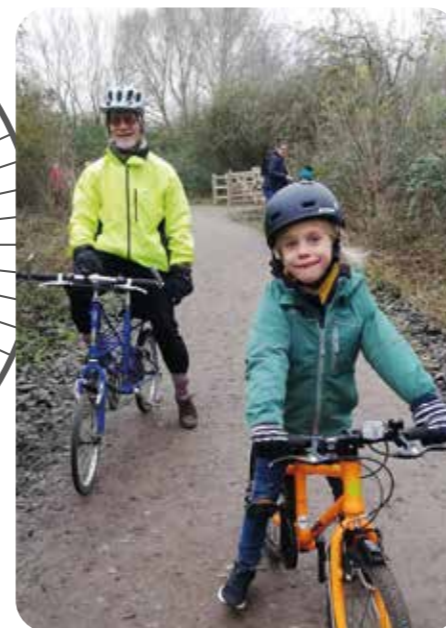
On my Moulton with grandson on his Frog