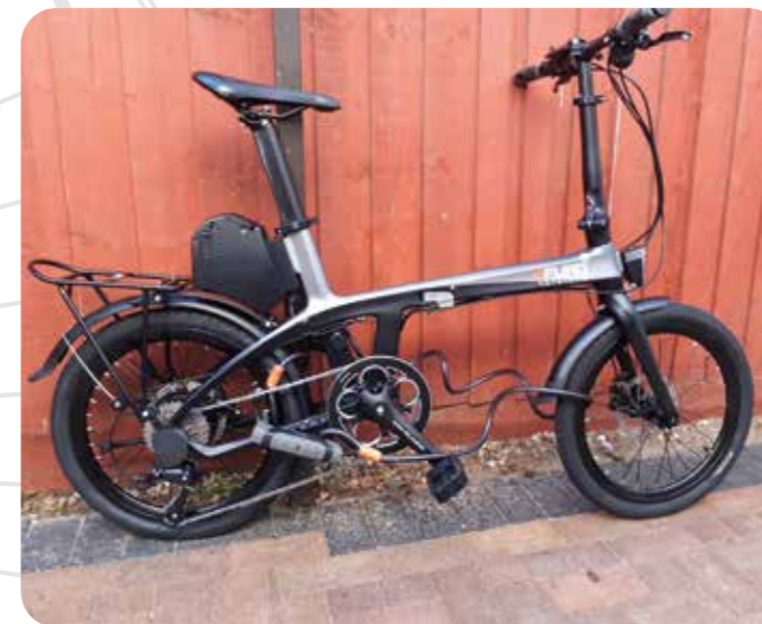
My folding e-bike (now for sale)

Subsequent efforts to acquire a lightweight, folding, recumbent e-trike have been difficult. The only one I could find that met all my criteria went out of production last year because no-one bought it. Having looked at machines from the Far East and Europe I came across an English company making trikes for people with disabilities – Tomcat UK. One of their models separates into two, making it possible to lift each part into the car.