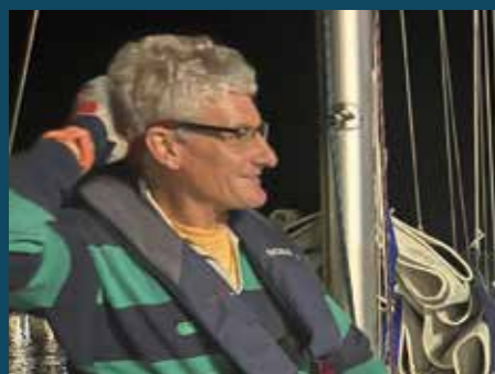
Heading out of Milford Haven 14/06/2023

every half hour, seven days a week, 24 hours a day. We found out that the pumps for the locks weren't working and to maintain water levels the lock gates would only open two hours before high water up to high water. The plan for Wednesday was to sail across the Irish Sea to Kilmore Quay in the Republic of Ireland. To arrive during daylight hours, we'd have to pass through the lock before the first high water which was 03.28hrs which was a few hours earlier than I had planned to leave.