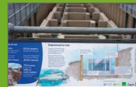
Worcester Fish Race

up the River Severn that had been blocked by the construction of weirs. Weirs and locks had been built during the Industrial Revolution to enable transport by barge up and down The Severn to the Midlands and were drastically endangering several species of fish. The day included a very informative guided tour of the historic locks and workshops at Diglis Island in Worcester and a visit to the underwater viewing gallery of the Fish Pass for an opportunity to see the Twaite Shad and Salmon swimming upstream.