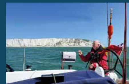
Beachy Head on route to Brighton

The following day our destination was Gosport. This meant a passage through the Looe channel off Selsey Bill. To get a favourable tidal stream through the channel it can be as much as 5knts. We needed to leave Brighton at 06.00hrs. The wind was still from the east and blowing 15knts so we made good headway.