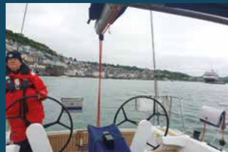
Leaving Dartmouth: cruise ship in background

side to see the steam train that runs to Paignton then the ferry back to the Dartmouth side for a beer and a meal. Walking back down to the river to catch the water taxi to the pontoon, we saw a small crowd who were being entertained by a large seal swimming around close to the old fortifications. A wonderful sight in this pretty natural harbour.