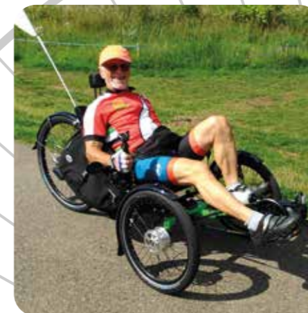
On the e-assisted ICE Adventure 26" HD at last!

This difference becomes apparent when a bicyclist attempts to ride an upright tricycle for the first time. The camber on most roads makes the novice tricycle rider feel he or she is falling towards the kerb, so they turn to the left to regain balance, and go straight into the ditch. This is not so obvious on a recumbent tricycle, partially because it does not feel as if one is on a bicycle: it is more like a car and, being much closer to the ground, it does not feel it is leaning as much. The conventional tricycle has the centre of gravity perhaps a couple of feet above the axle, whereas a recumbent tricycle, with a centre of gravity only a few inches above the axle, is very much more stable."